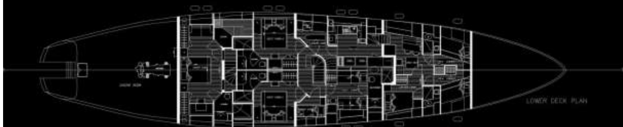
LOWER DECK PLAN