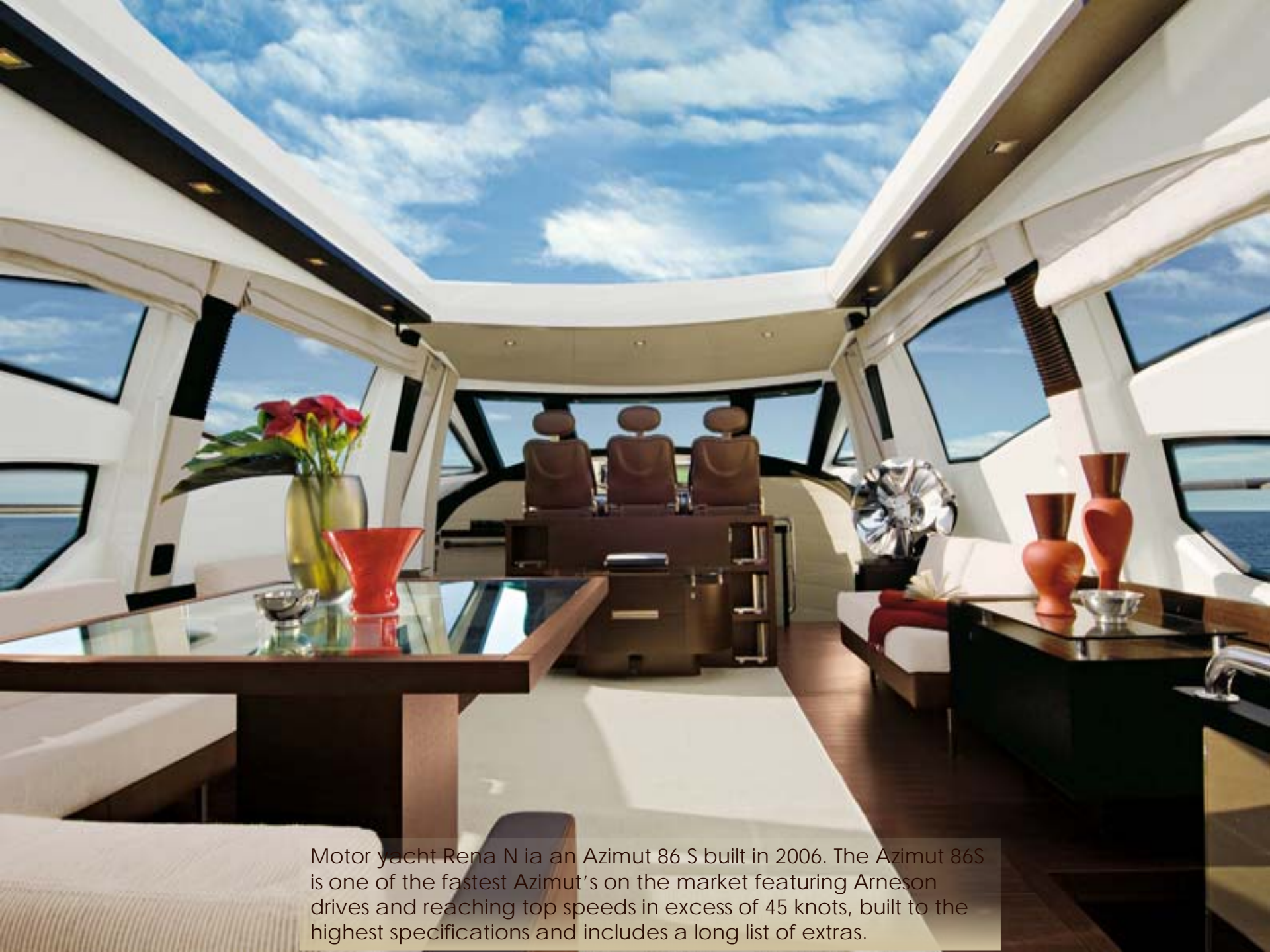
Motor yacht Rena N is an Azimut 86 S built in 2006. The Azimut 86S is one of the fastest Azimut's on the market featuring Arneson drives and reaching top speeds in excess of 45 knots, built to the highest specifications and includes a long list of extras.